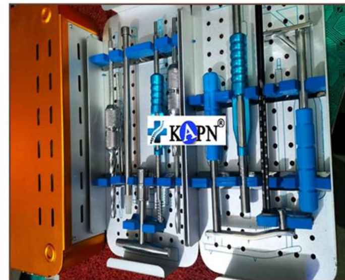
DHS DCH INSTRUMENT SET