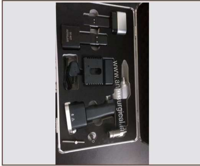
BATTERY OPERATED DRILL MACHINE