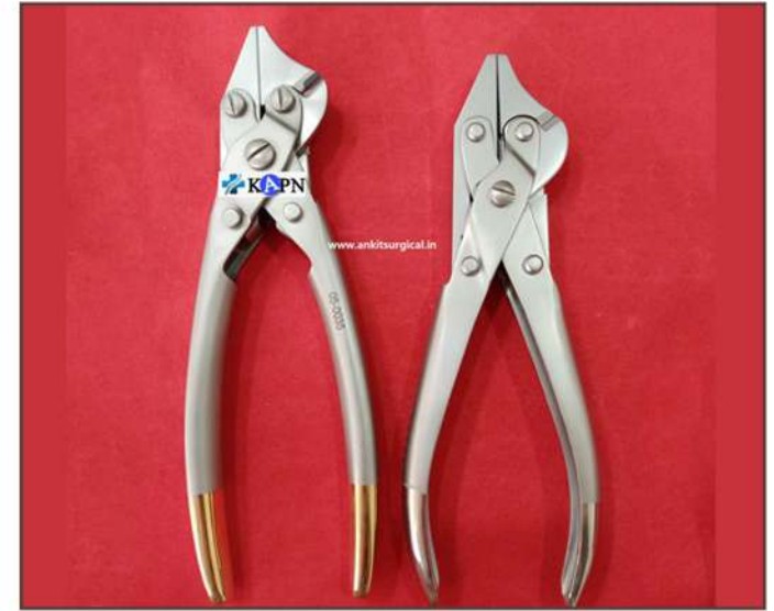
PARALLEL PLIER (MOON PLIER)