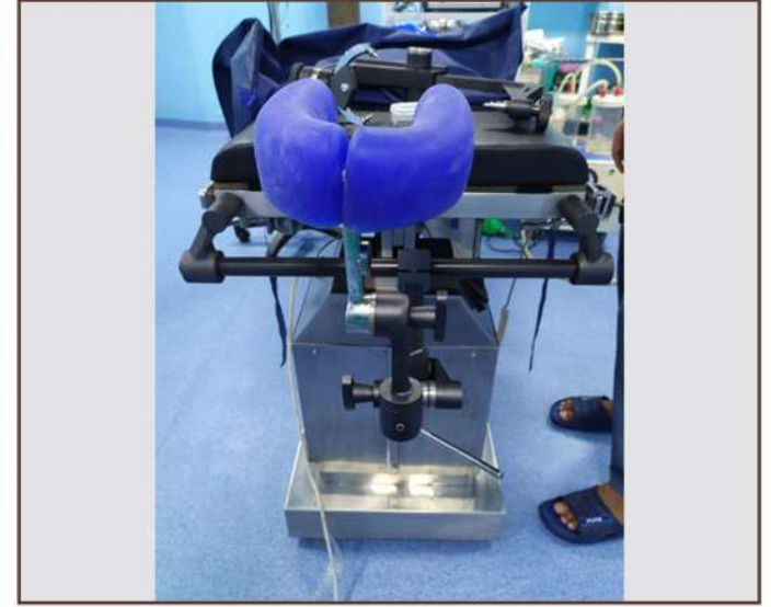
MEYFIELD RETRACTOR 3 PIN BLACK