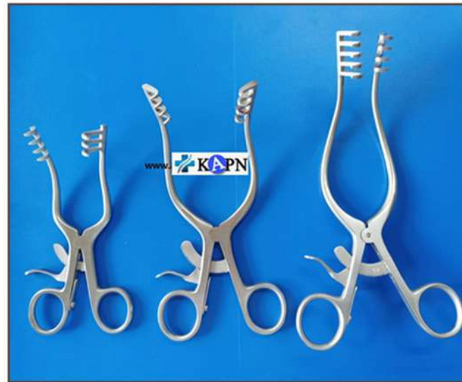
SELF RETAINING RETRACTOR WITHOUT HINGE