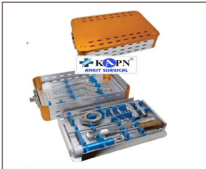
AMP INSTRUMENT SET/AUSTIN MOORE INSTRUMENTS SET