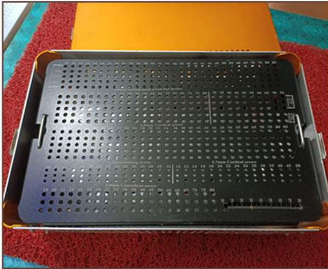
SCREW BOX 3.5, 2.7MM