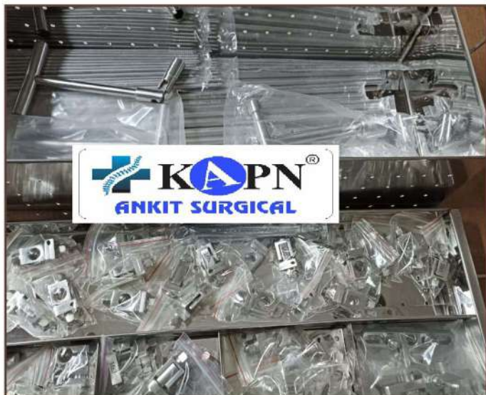
EXTERNAL FIXATOR SET