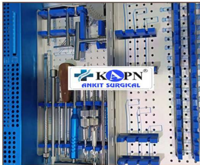
DHS DCH PLATE INSTRUMENT SET