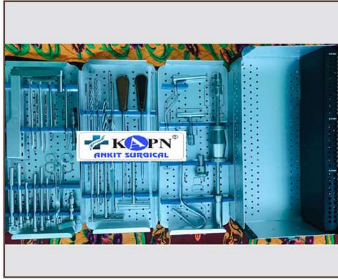
PFN INSTRUMENT SET