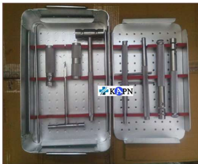
ENDERS NAIL SET / RUSH NAIL SET SQUARE NAIL SET