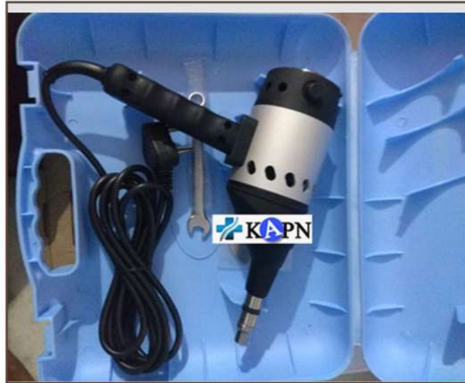
POP CUTTER/ PLASTER CUTTER ELECTRIC