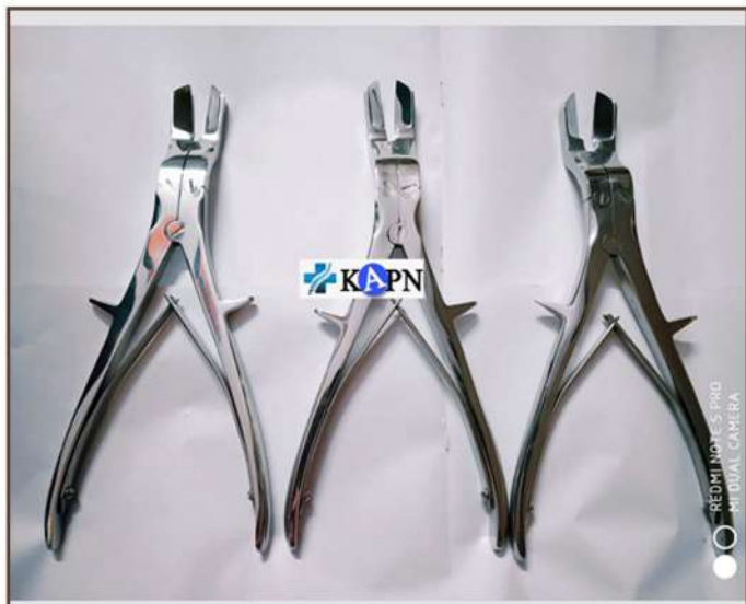
BONE CUTTER N