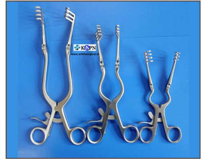
SELF RETAINING RETRACTOR