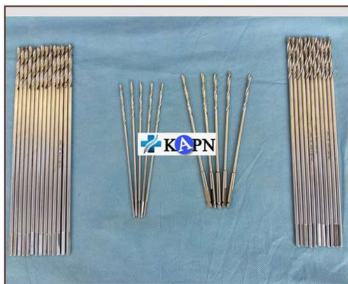
BONE DRILL BITTS