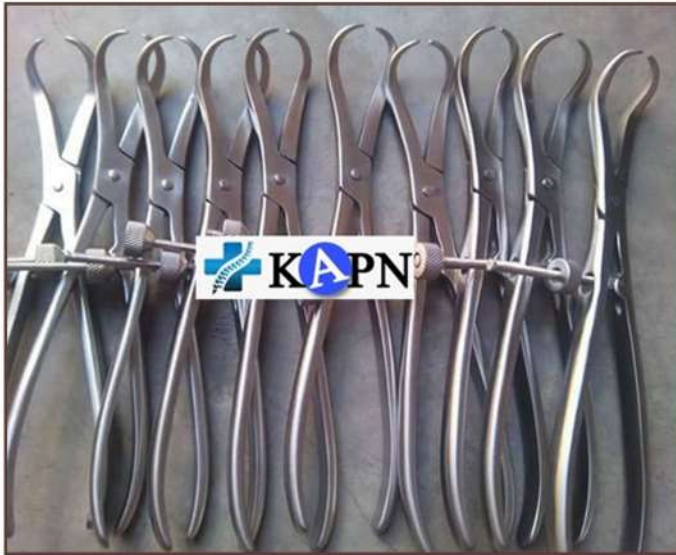
REDUCTION FORCEP POINTED