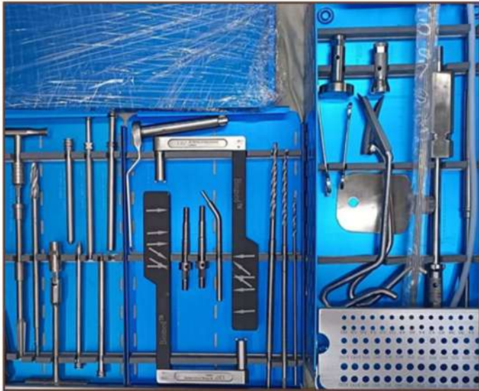
PFN TFN SET