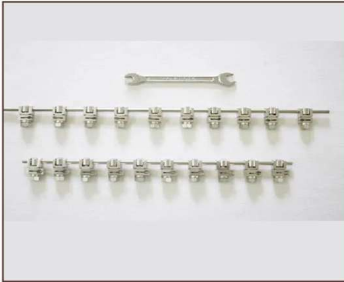
DELUX CLAMP/ EXTERNAL FIXATOR