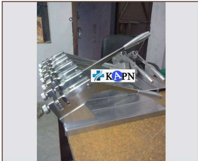
PLATE BENDING PRESS