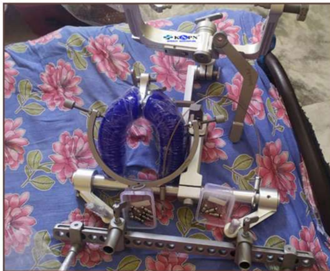
MEYFIELD RETRACTOR 3 PIN SET