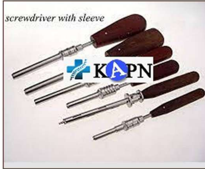
SCREW DRIVER WITH HOLDING SET