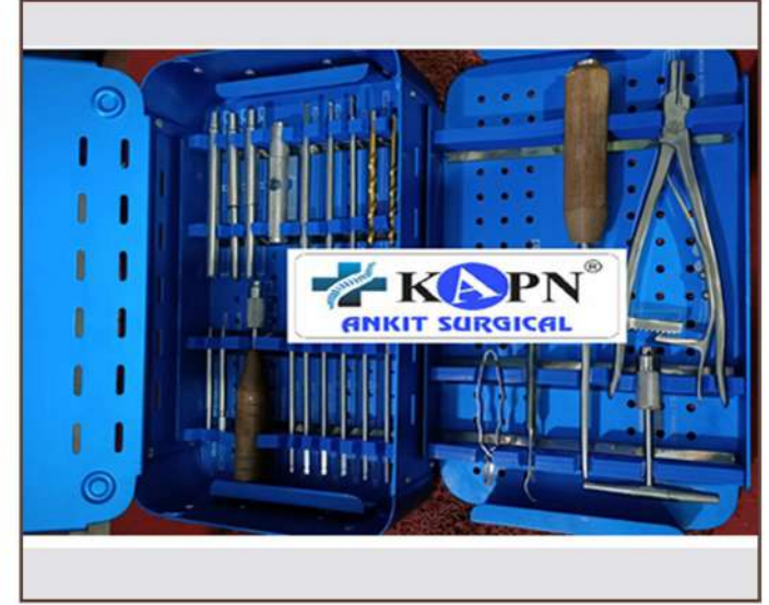
BROKEN SCREW REMOVAL SET