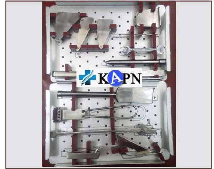
CONDYLAR PLATE SET ANGEL BLADE PLATE SET