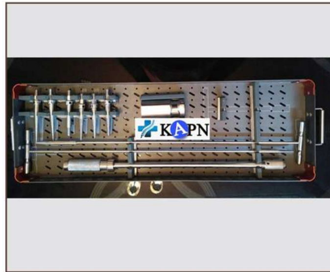
NAIL REMOVAL SET