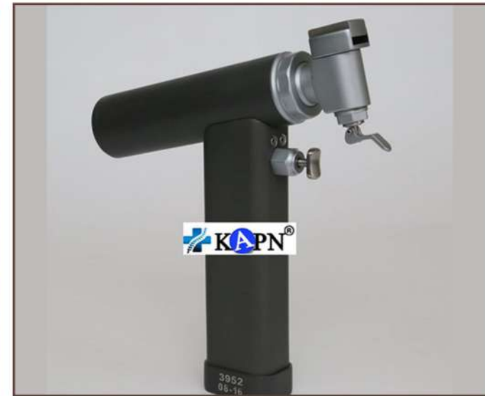
BATTERY OPERATED DRILL SAW MACHINE