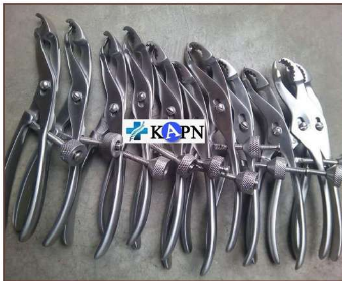
SELF CENTRING FORCEP